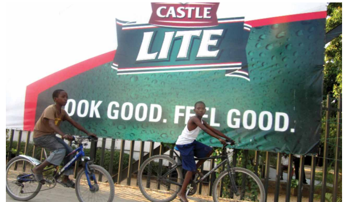
The marketing of alcohol is a factor in increased drinking in general and early initiation in particular.

International evidence has established the health harms and HIV risk is associated with alcohol consumption, but little data had been previously collected or analysed in Tanzania specifically.